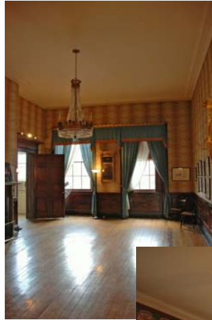
◀ Drawing Room 40 seated dining style or 50 theatre style.

Carroll Mansion is available for rental during normal business hours for meetings and after hours for receptions and special events. The Mansion has three gracious rooms for rental en-suite. They will accommodate 80 seated dining style or 150 for a standing reception.