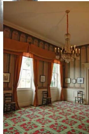
Dining Room ▶ 20 seated dining style or 25 theatre style.