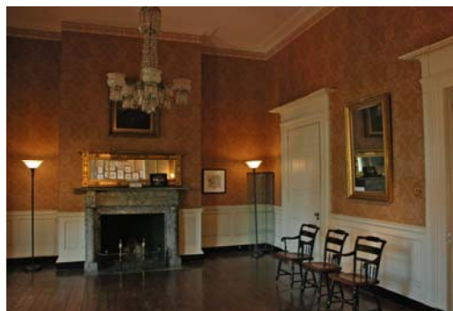
▼ Parlor 20 seated dining style or 25 theatre style.

The Mansion's Hospitality Room located on the ground floor, hosts the Carroll Mansion Art Gallery. It accommodates up to 30 people, opens onto the Garden Courtyard, and is perfect for meetings and luncheons.